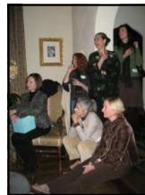
NPCT board members and supporters listen to Dr. Weddington speak about her experience arguing Roe v. Wade.