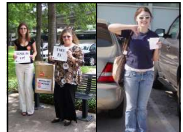
Volunteers make it happen! Left: Volunteers in Houston prepare to storm Sen. Hutchison's office. Right: A student volunteer in Dallas attempts (unsuccessfully) to get a prescription for emergency contraception filled.