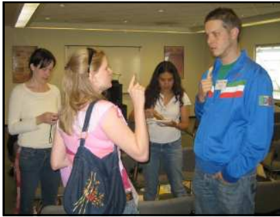
Students at a campus organizer training in Houston co-hosted by NARAL Pro-Choice Texas Foundation

NARAL Pro-Choice Texas is excited to announce the launch of a major public interest campaign which will be conducted in Houston starting in 2008. Thanks to a grant from NARAL Pro-Choice America, we will spend the next