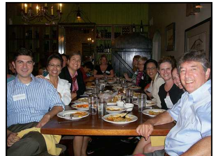
Texas legislators at a NARAL Pro-Choice Texas member luncheon last summer