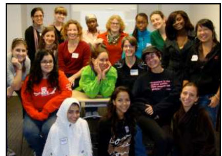
NARAL Pro-Choice Texas staff and volunteers with other members of the national RISE Initiative for youth