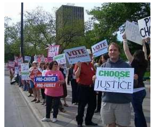
Over 150 supporters gathered at the State Capitol on April 19 to protest the Supreme Court's decision

In times like these, it's important to reflect on powerful demonstrations of our values like the March for Women's Lives on Washington, DC just three years ago in April 2004. While many were not able to attend, the 1.4 million people who marched that day created the largest march of its kind in American history. We are pro-choice America; we are pro-choice Texans and we will prevail .